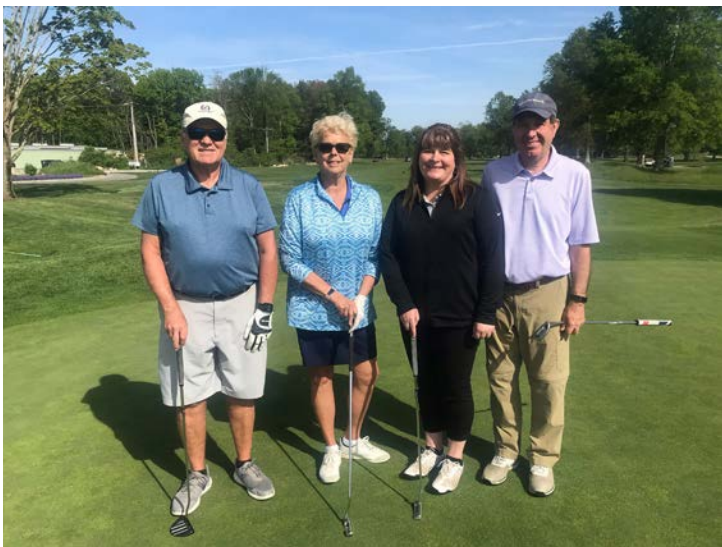
Team Chelsea Groton Bank