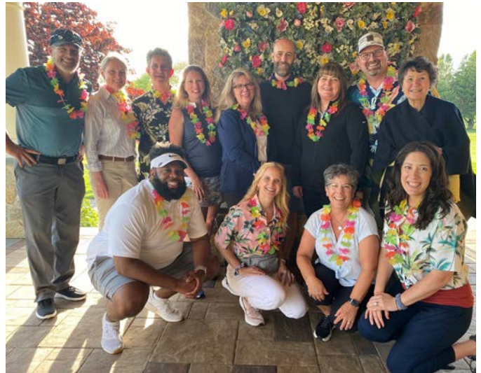
Foundation Board Members