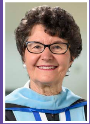
Message from the President of Three Rivers Community College