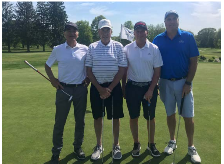
Team General Dynamics/Electric Boat