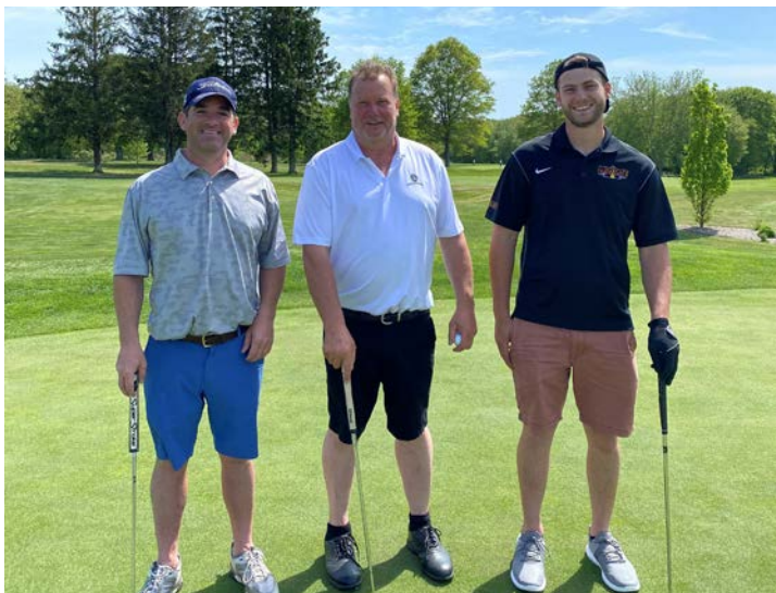
Team Mariner Financial Group LLC.