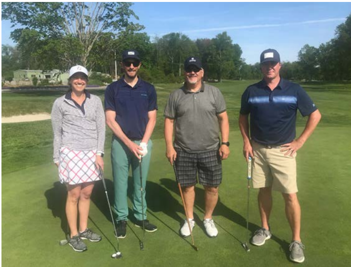
Team Backus Hospital