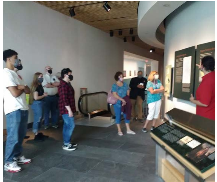
Mashantucket Pequot Museum and Research Center

The Community Foundation of Eastern CT continued to invest in Three Rivers' Environmental Research, Fieldwork, and Hands-on Learning Internship which provides vital educational opportunities in the rapidly growing world of environmental studies. The program focuses on supporting first-generation, non-traditional, and historically under-represented student populations to increase their enrollment, retention, and graduation in STEM programs and specifically issues pertaining to the environment.