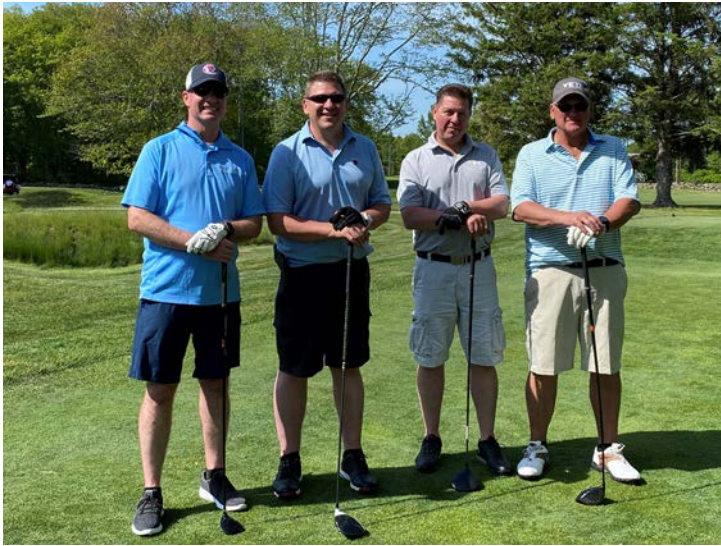
Team P & D Mechanical