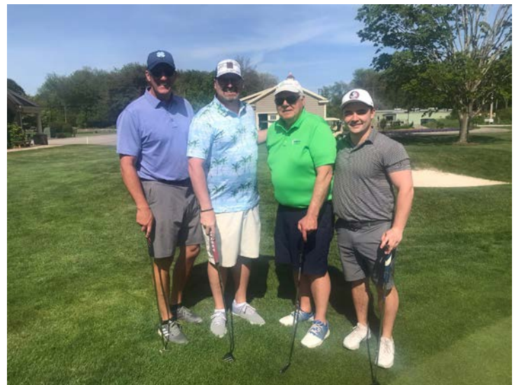
Team Eastern CT Savings Bank