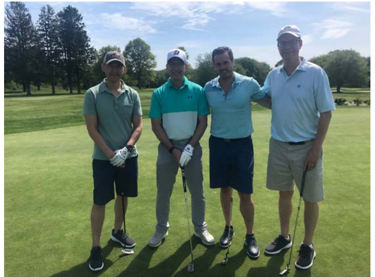
Team L+M Hospital