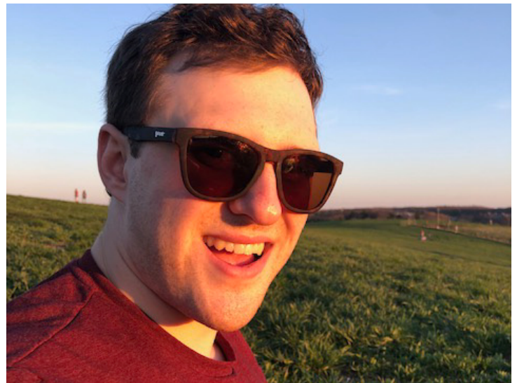
Benjamin Jackson, Joan Grove & Carolyn Krohn Endowed Scholarship