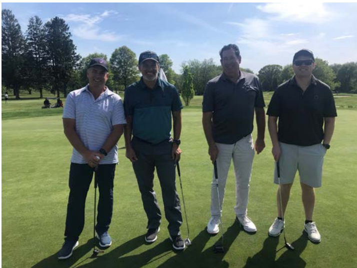
Team Dominion Energy