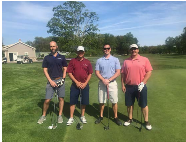
Team Dime Bank

A special thank you to all golfers, sponsors and volunteers - your support continues to help students attend Three Rivers.